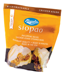
B1200 CHICKEN ASADO SIOPAO 5 OZ 12 / 20 oz