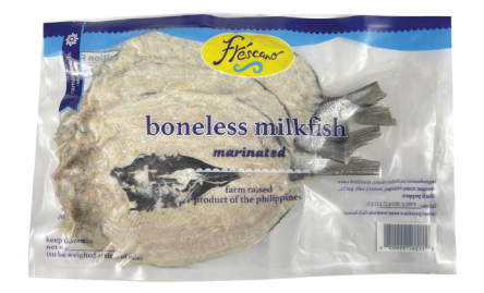
F440SN MILKFISH BONELESS BUTTERFLY 33 lbs