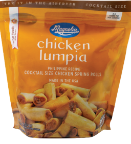
M317 CHICKEN 1.5 LBS 12 / 1.5 lbs