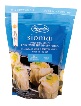
BB1006 PORK WITH SHRIMP WITH SIOMAI 12 OZ 12 / 10 oz